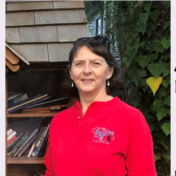
A Message from the Intern