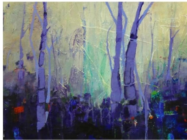
Trees Share Their Stories

One collector asked to see a green painting, but when I showed her an abstract called “Lifeline” she burst into tears. I would not let her take it because I knew the right match for her would come along, work with her room, and cause no tears. This painting went to a collector who thought it felt uplifting and made her think of gratitude. That is what I consider good matchmaking. Another good match was a painting called “Grey’s Elegy” purchased by a literature major who understood it and even recognized my father’s favorite poem.