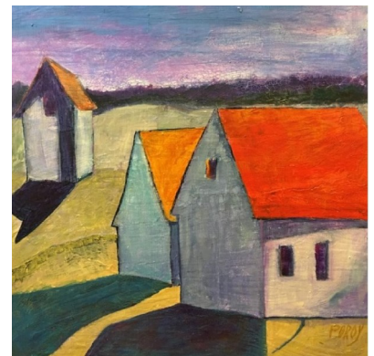
Keep the Lights On