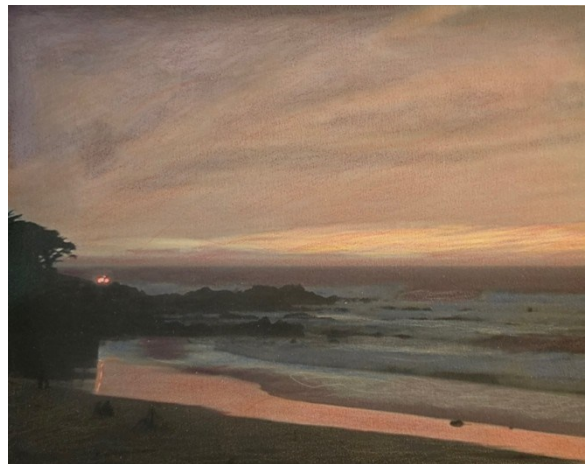
Coming Round the Bend

Prints are $250, and may be purchased by emailing me at dixonline@comcast.net , or calling me at 831-236-3111.