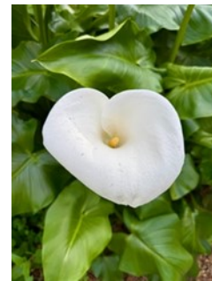
#UU Lent "Heart"